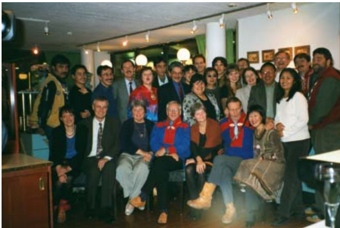
The Permanent Participant delegation at the November meetings in Finland.