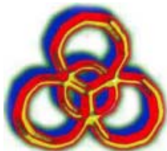
The Logo of Saami Council